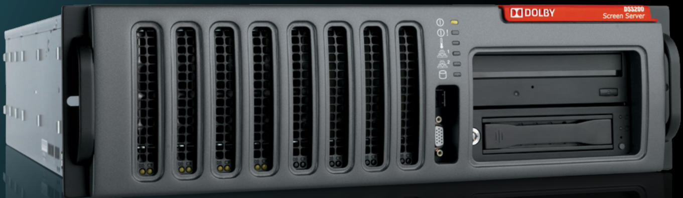
The new Dolby Screen Server (DSS200)

A powerful, reliable digital cinema solution, designed by Dolby specifically for the cinema.